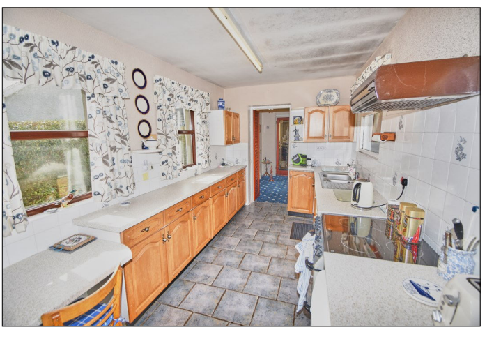
With plaster coving and cornicing. 12'9 x 11'3

With bowl and half stainless steel sink unit, high and low level built in units with tiling between, space for cooker, extractor fan above, space for fridge, glass display cabinets, drawer bank, saucepan drawer, larder cupboard and tiled floor. 17'9 x 7'10