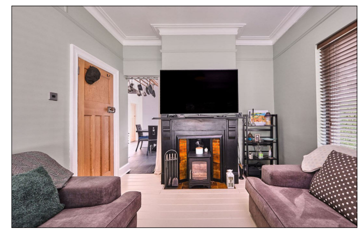
Kitchen/Dining Area: 14'9 x 9'3

With 3KW multi fuel log burner with original fireplace with tiled hearth and inset, plaster coving, picture rail and wooden floor.