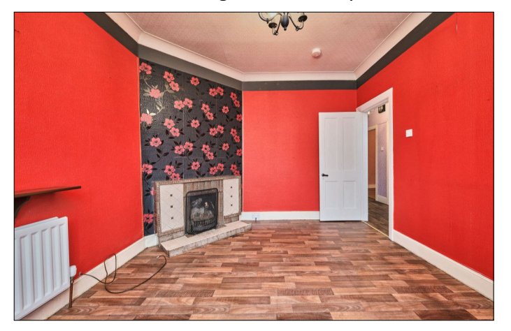
Dining Room: With picture rail and tiled floor. 10'10 x 9'9

With tiled surround fireplace with tiled inset and tiled hearth and coving. 12'9 into bay x 10'10