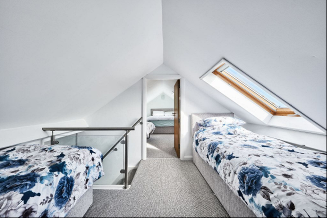
Bedroom 4: With 'Velux' window. 14'3 x 8'3